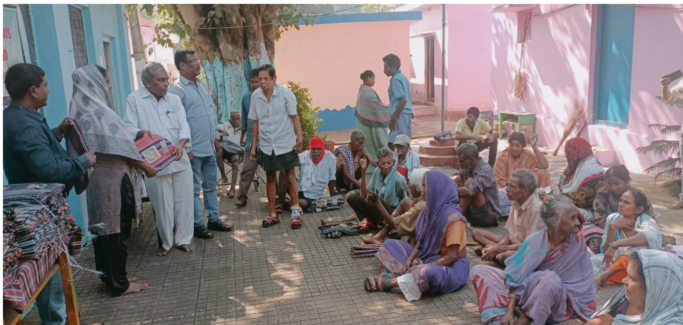
Health awareness and medical camp to the leprosy victims and distributing the Medical kits