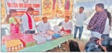
రోగులను పరీక్షిస్తున్న వైద్యుడు